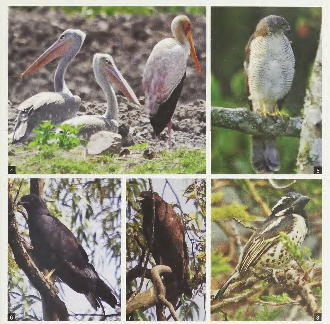
Figure 4. Pink-backed Pelicans Pelecanus rufescens and Yellow-billed Stork Mycteria ibis (right), fish ponds near Kigabiro, Eastern Province, Rwanda, July 2015 (B. Boedts)

Pélican gris Pelecanus rufescens et Tantale ibis Mycteria ibis , étangs piscicoles aux environs de Kigabiro, Province de l'Est, Rwanda, juillet 2015 (B. Boedts)